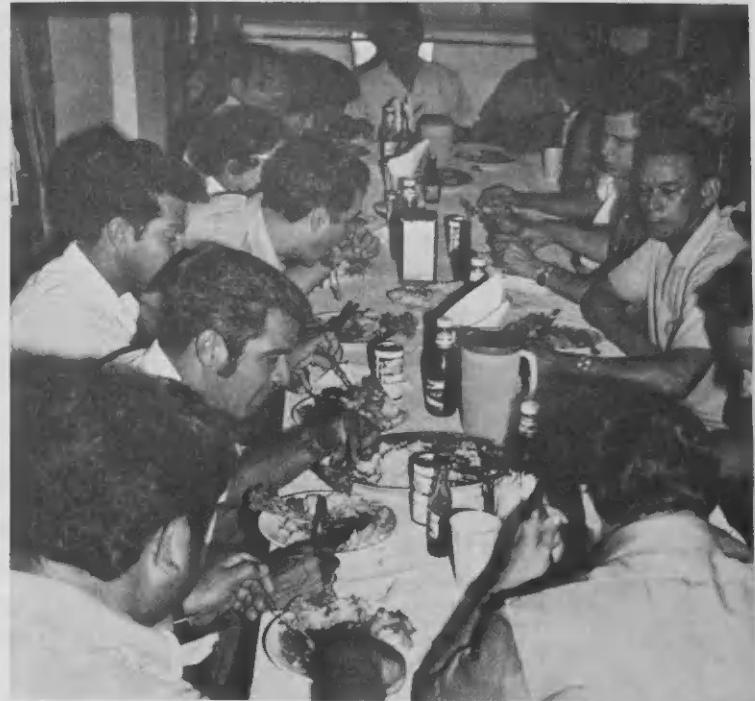
■ part of their Christmas celebration, Lab employees joined for cocktails and dinner at Pension Antilliana on December 14.